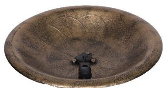
Fountain Basin (Pump Preinstalled)