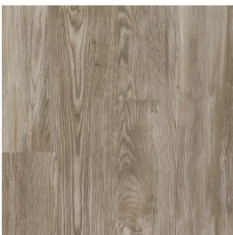
201LP641 Forest Truffle