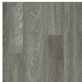
209AP641 Thunder Cloud