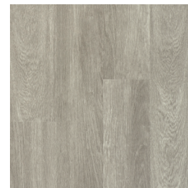
211AP641 Silver Dawn