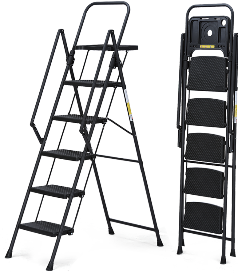
Household Steel Ladder Series