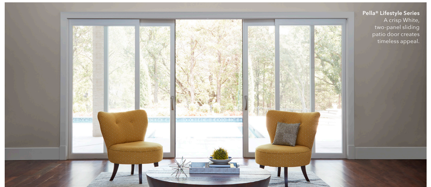
Pella® Lifestyle Series A crisp White, two-panel sliding patio door creates timeless appeal.

Warranty information is correct as of 4/1/2021. Warranties are subject to change and buyers are subject to the current warranty at time of sale. See pella.com/warranty for all current and historical warranties as well as additional details, limitations, and exclusions.