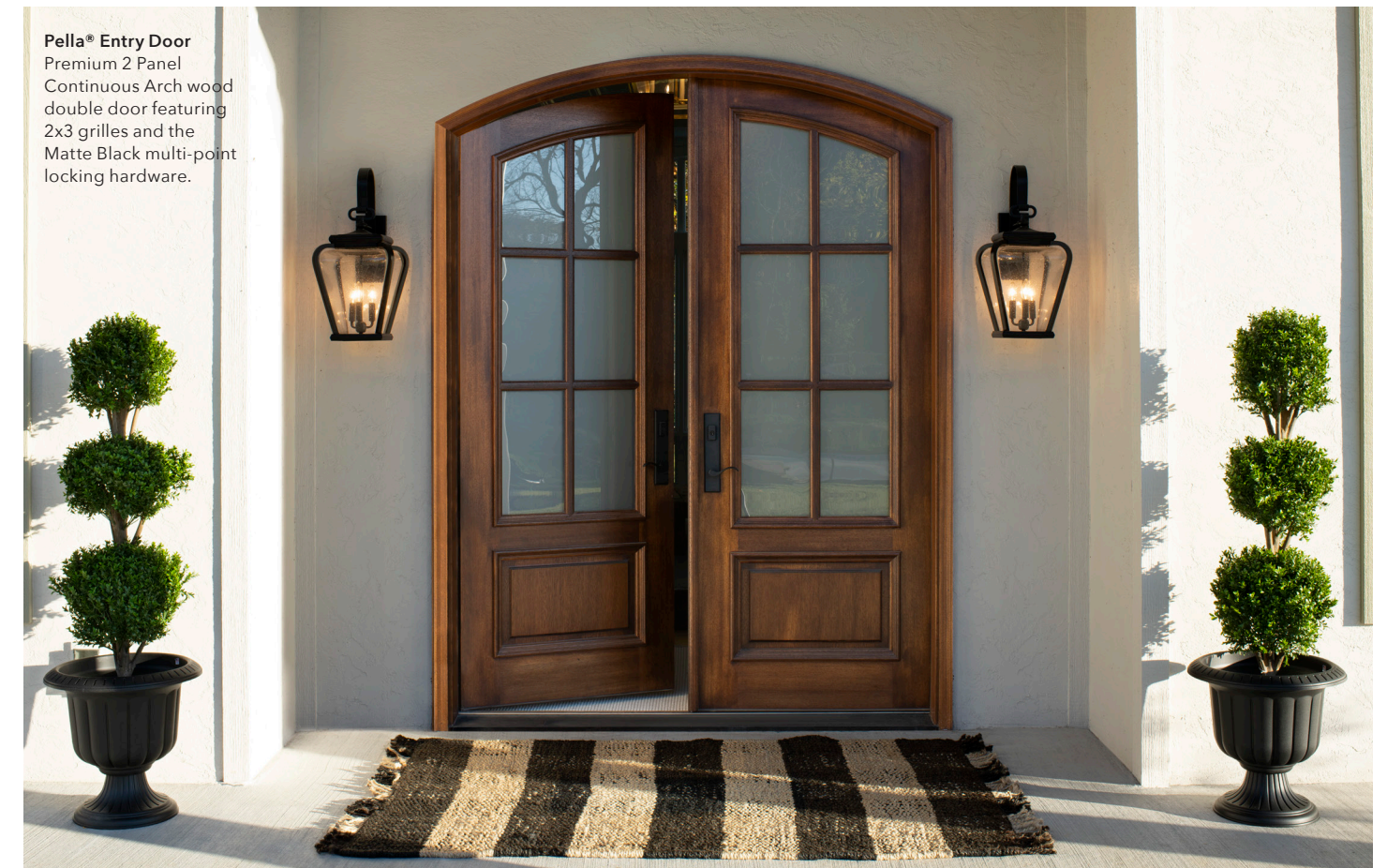
Pella® Entry Door Premium 2 Panel Continuous Arch wood double door featuring 2x3 grilles and the Matte Black multi-point locking hardware.

Warranty information is correct as of 8/6/2020. Warranties are subject to change and buyers are subject to the current warranty at time of sale. See pella.com/warranty for all current and historical warranties as well as additional details, limitations and exclusions.