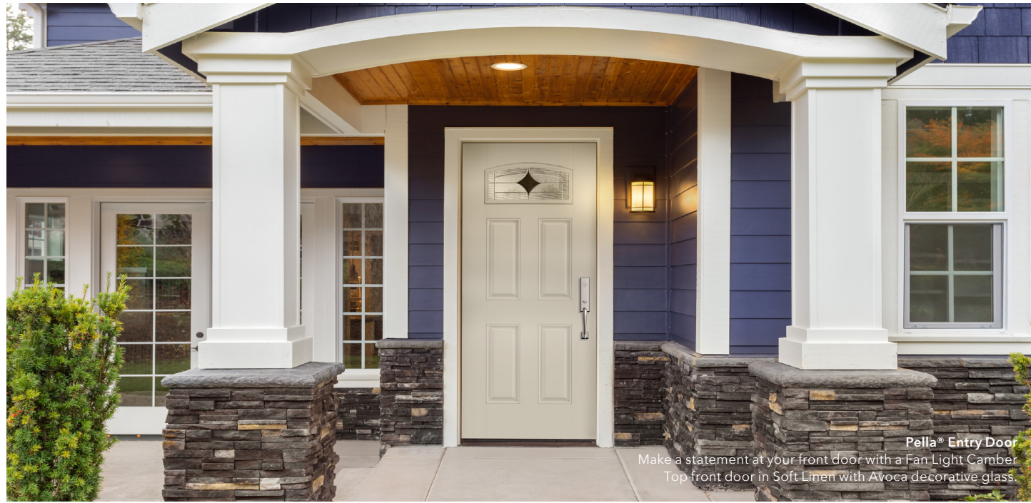
Pella® Entry Door Make a statement at your front door with a Fan Light Camber Top front door in Soft Linen with Avoca decorative glass.