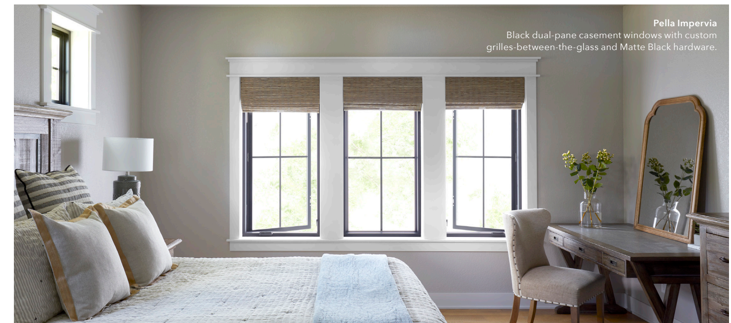
Pella Impervia Black dual-pane casement windows with custom grilles-between-the-glass and Matte Black hardware.

Warranty information is correct as of 4/1/2021. Warranties are subject to change and buyers are subject to the current warranty at time of sale. See pella.com/warranty for all current and historical warranties as well as additional details, limitations, and exclusions.