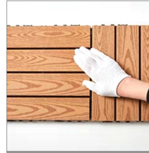
2 Press hard for snapping tight.