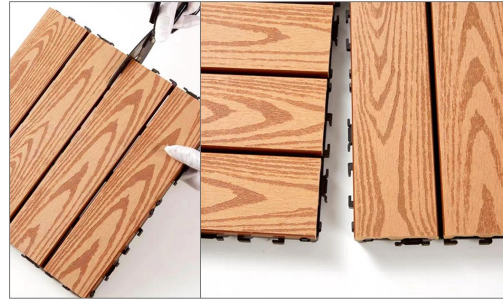
1 Align the snaps of the two deck tile.

EASY to INSTALL: The composite decking features an interlocking mechanism, easily snapped together without using tools; For DIY lovers, our tile is simple to cut with a jigsaw to fit any specific space both inside and outside your home