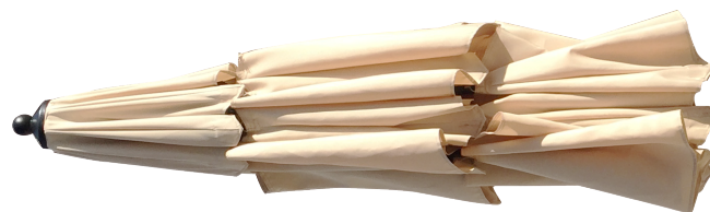
Umbrella Canopy x 1