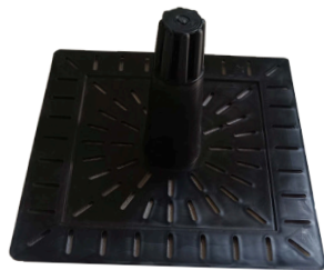
B. Self-Watering Tray