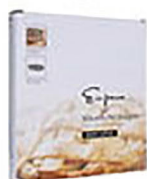
Silicone Pie Weights