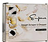
5 inch Mini Dough Scraper