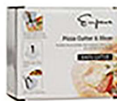
Mini Pizza Cutter with Lock