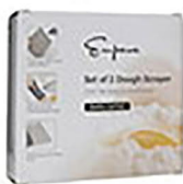
Bowl Scraper & Dough Chopper