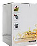
Kitchen Gadget With Herb Stripper Set