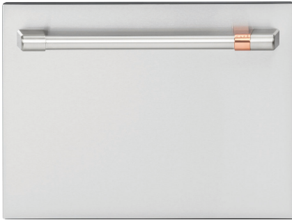
CDD220P2WS1 Stainless Steel with Brushed Stainless handle