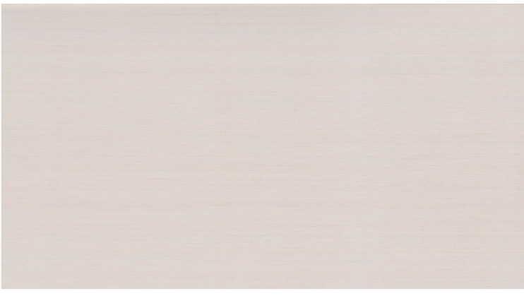
Blondewood/RevolutionPly® Primed Back