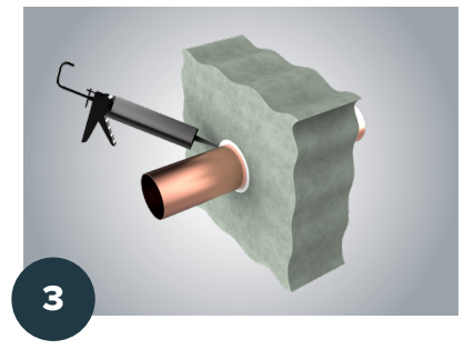
Apply caulking as required to close remaining gap to both sides of wall assembly; providing a smoke and gas resistant seal. Spread caulking smoothly and evenly all around.