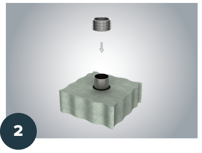
Install pipes or cables. Install backing material as required into annular space as shown to both sides of floor assembly.