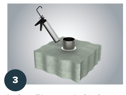
Apply caulking as required to close remaining gap to both sides of floor assembly; providing a smoke and gas resistant seal. Spread caulking smoothly and evenly all around.