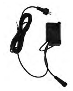
B. Auto Shut Off Pump