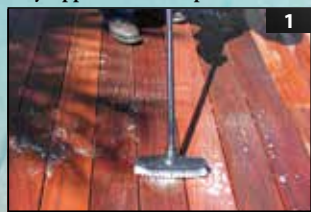
1. SCRUB CLEAN & LET DRY

SHAKE, STIR & MIX WELL • Questions/Comments: www.DeckWise.com