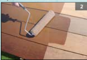
2. APPLY IPE OIL™