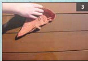
3. WIPE OFF EXCESS