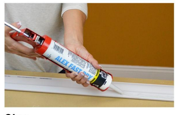
Glue Glue with a water-based painter's caulk.