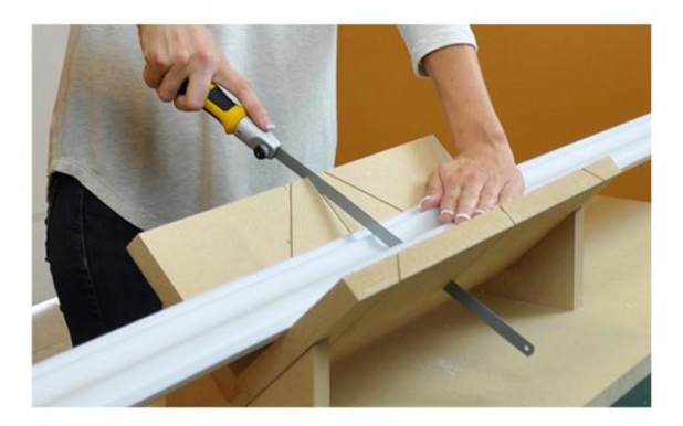
Cut Material is easy to cut with a simple saw.