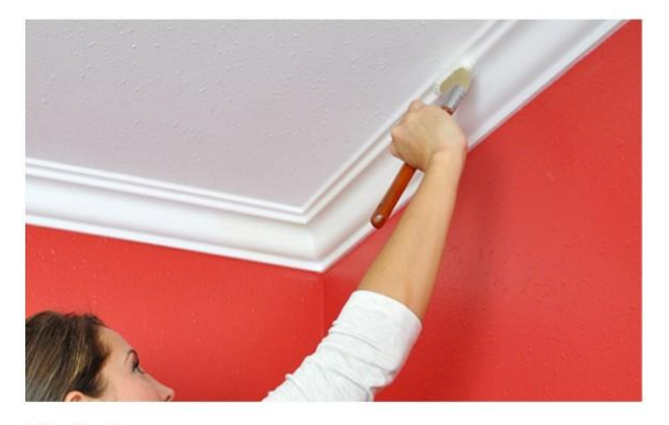
Paint Finish with a latex-based paint.