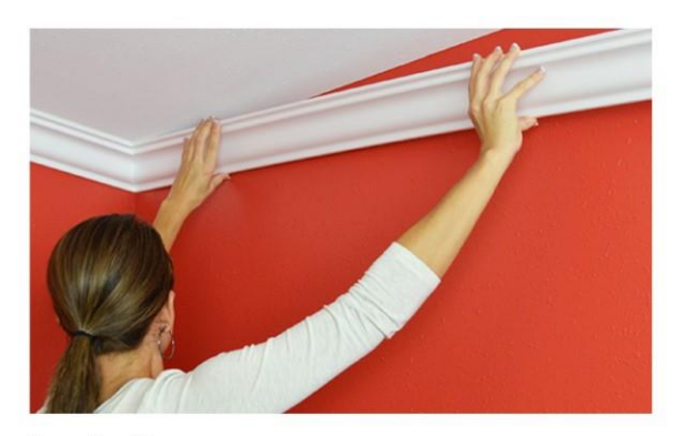
Install Press into place.