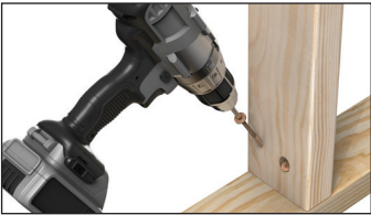
WOOD-TO-WOOD FRAMING CONNECTIONS