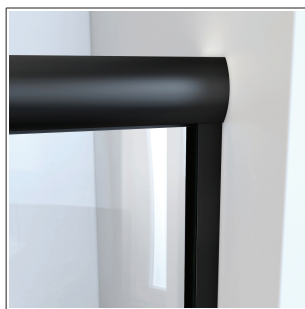
Shower Door Wall Profile