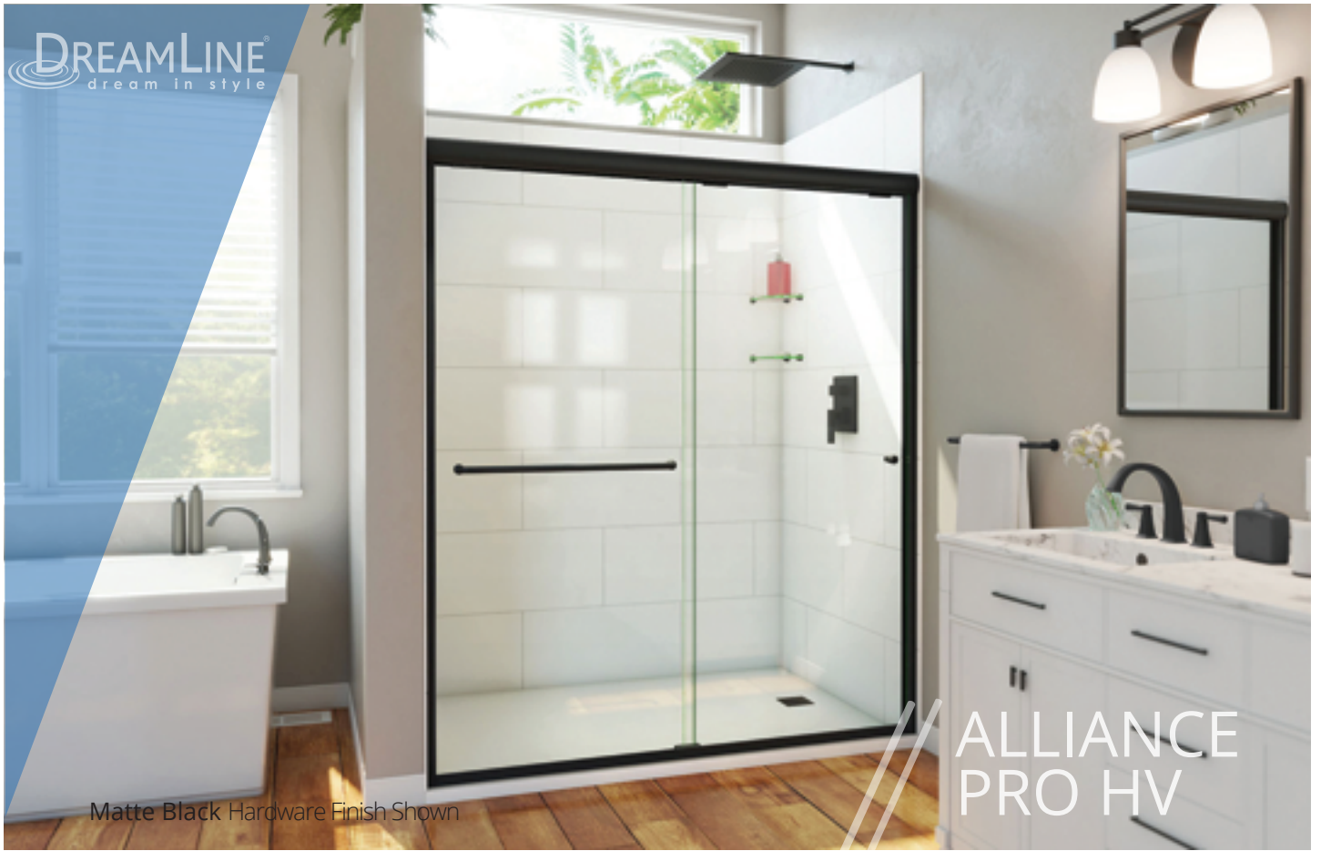
Matte Black Hardware Finish Shown