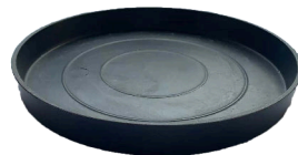
D. Saucer Tray