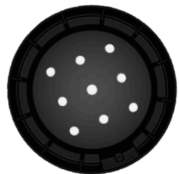
B. Self-Watering Tray