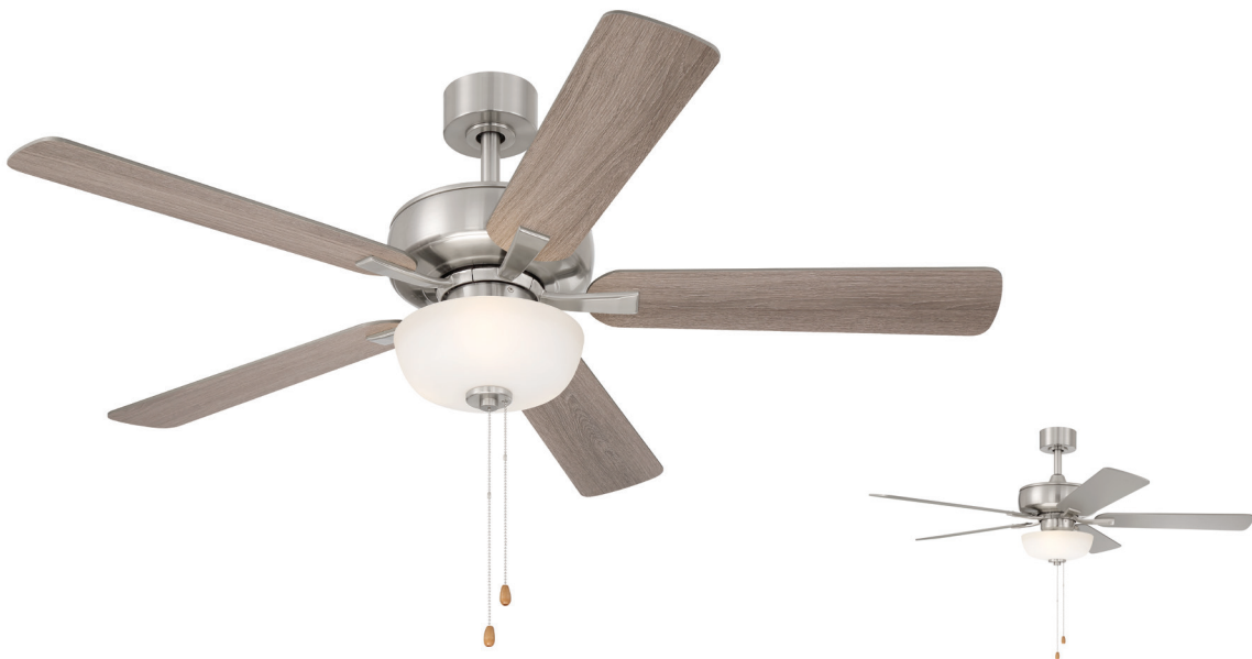
FP-GLT52B30-BN Brushed Nickel finish with Pearl Gray blade finish | Inset: Silver blade finish