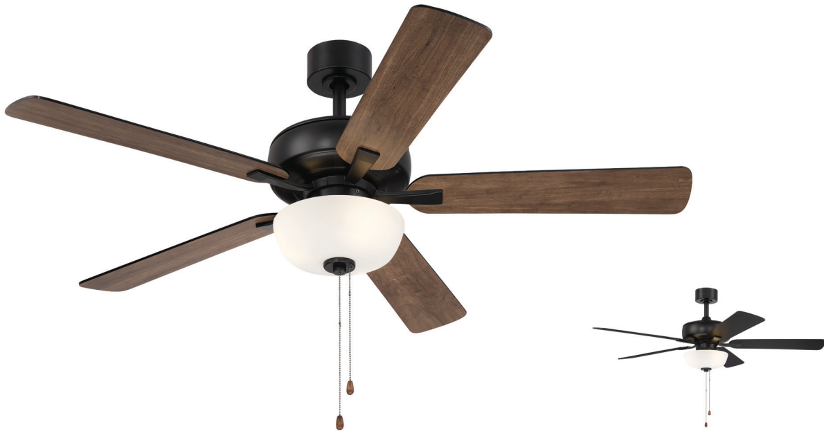
FP-GLT52B30-MB Matte Black finish with Sepia Brown blade finish | Inset: Matte Black blade finish