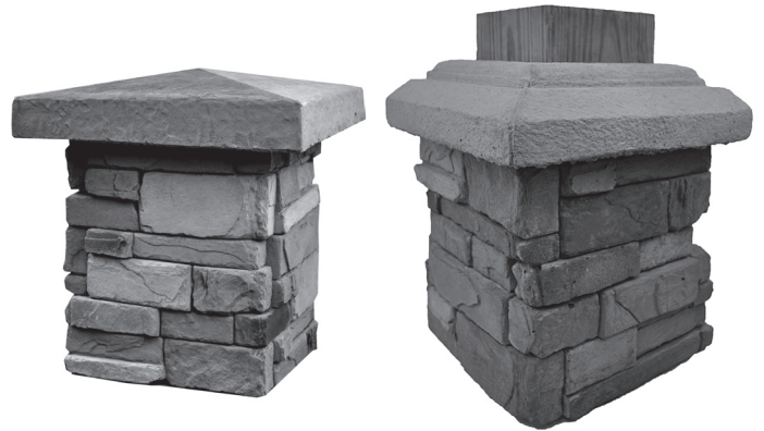
Pyramid Post Cap

Rotate 1/4 turn and repeat Step 2 by stacking the next row directly on top of the first row and continue with each additional row. As you are working up the post, other necessary adjustments may need to be made. Install Spacer Disks where necessary.