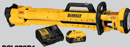
DCL079R1 20V MAX* Tripod Light Kit