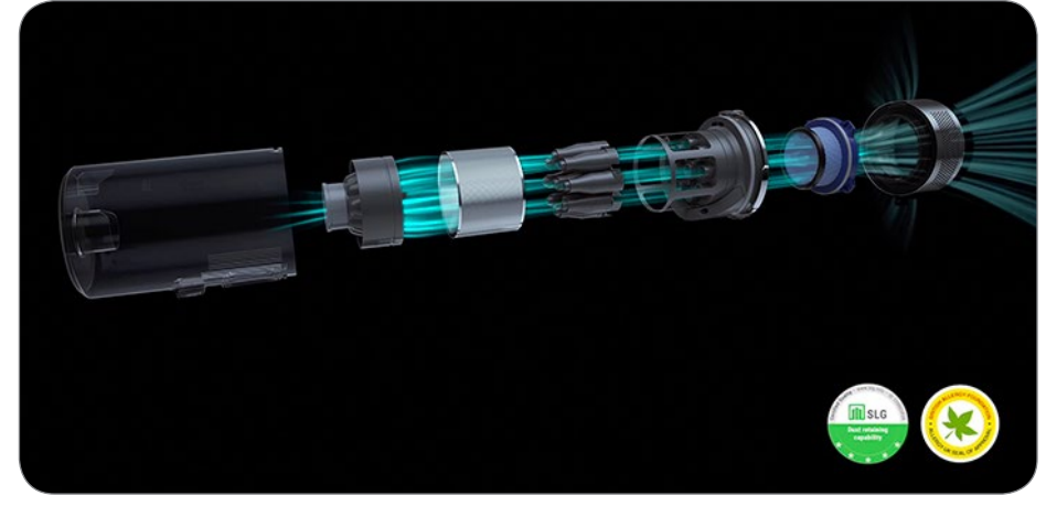
5 Layered HEPA Filtration System