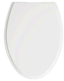
Toilet Seat & Lid