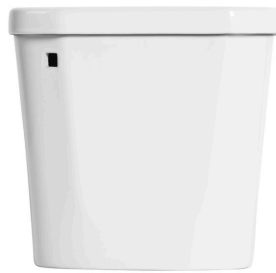
Pre-assembled Toilet Tank