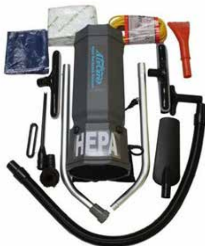
HEPA Back Pack Vacuum