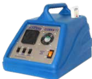
Cobra Power Brush System