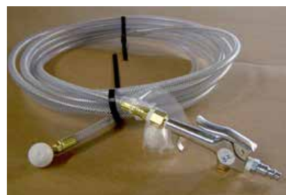
Forward and Reverse Air Whisk System