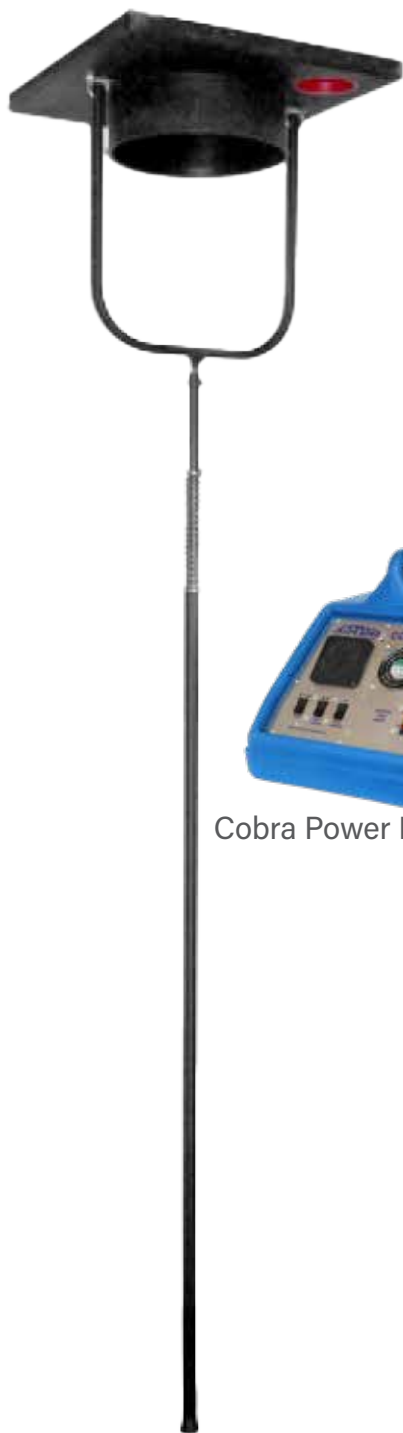
12" Pogo Pole Hose Adapter (Complete Assembly comes with Pole, Fork, 20 X 20 X 2 Foam attached to 12" Steel Pogo Plate (Ref#16) & 4" Red Cap Plug)