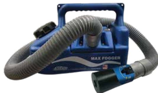
Air Care Fogger