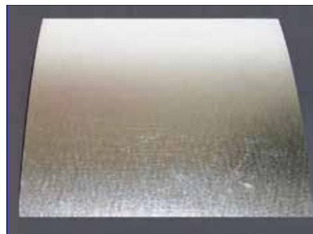
12" x 12", 26 gauge, Galvanized Steel Duct Patches