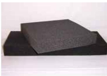
Foam Register Plugs (14/pkg)