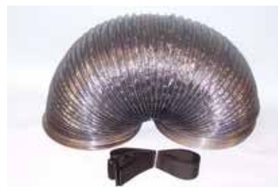
12" x 12.5" Light Duty Mylar Hose with Velcro Straps