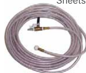
Sidewinder Hose Assembly