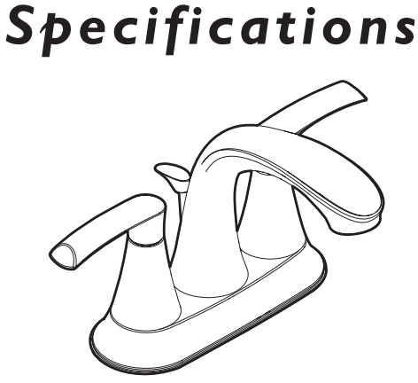
Graeden™ Two-Handle 4" Centerset Lavatory Faucet

Thin and thick deck mounting hardware kits available