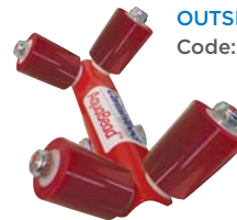
OUTSIDE 90° Code: 405325