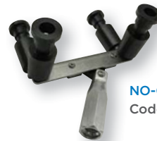
NO-COAT® PRO Code: 640675