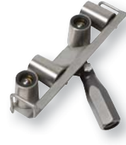
INSIDE 90 Code: 640679