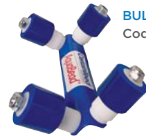
BULLNOSE Code: 405326