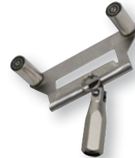
ONE SIDED Code: 640678