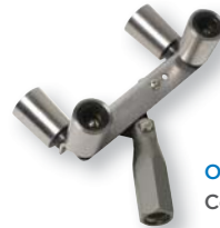
OUTSIDE 90 Code: 640677