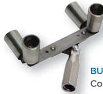
BULLNOSE Code: 639616