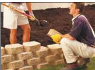
3. Install Additional Courses

Place and level the first Keystone Garden Wall unit. Level each additional unit on the base course as you place it, making sure that the outside edges touch. If your wall contains both straight and curved areas, start with a straight area and build into the curves. Complete the base course before proceeding to the second course.