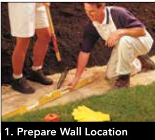
1. Prepare Wall Location

Start by digging a shallow trench 4" (102mm) deep by 12" (305mm) wide. Cut through and remove any sod, roots or large rocks. For organic loam soils, dig 4" (102mm) deeper and add a leveling pad of sand or gravel. Compact and level the soil to receive the first course of Keystone Garden Wall.