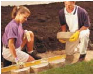
2. Place & Compact Backfill

Start by digging a shallow trench 4" (102mm) deep by 12" (305mm) wide. Cut through and remove any sod, roots or large rocks. For organic loam soils, dig 4" (102mm) deeper and add a leveling pad of sand or gravel. Compact and level the soil to receive the first course of Keystone Garden Wall.