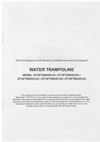
Instruction Manual x1