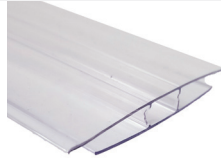
TUFTEX H-Channel Profile Joins two panels side by side 96" long Model #854