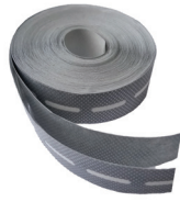
Anti-Dust Tape Solid & Vented (1" x 32 yards) Model #855