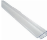
TUFTEX U-Channel Profile Seals top & bottom of panels 96" long Model #853