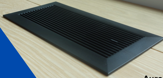
Aurora Series shown

The PRONOVA Products Aurora Series Vent is a 2 piece construction design. These vents can be seamlessly installed in floors, walls and ceilings, ensuring a clean aesthetically pleasing appearance without any exposed fasteners. The product offers a combination of functionality, durability, and sleek design, enhancing the overall interior environment.