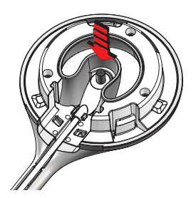
Take the connector end of the power adapter cord and snap into place.

Choose your region's power adapter and snap into place.