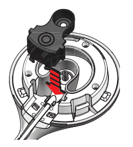
Replace the connector cover.