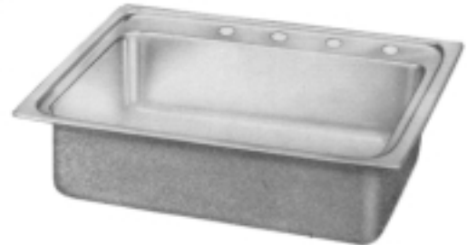
Model PSR-2521-4 Shown