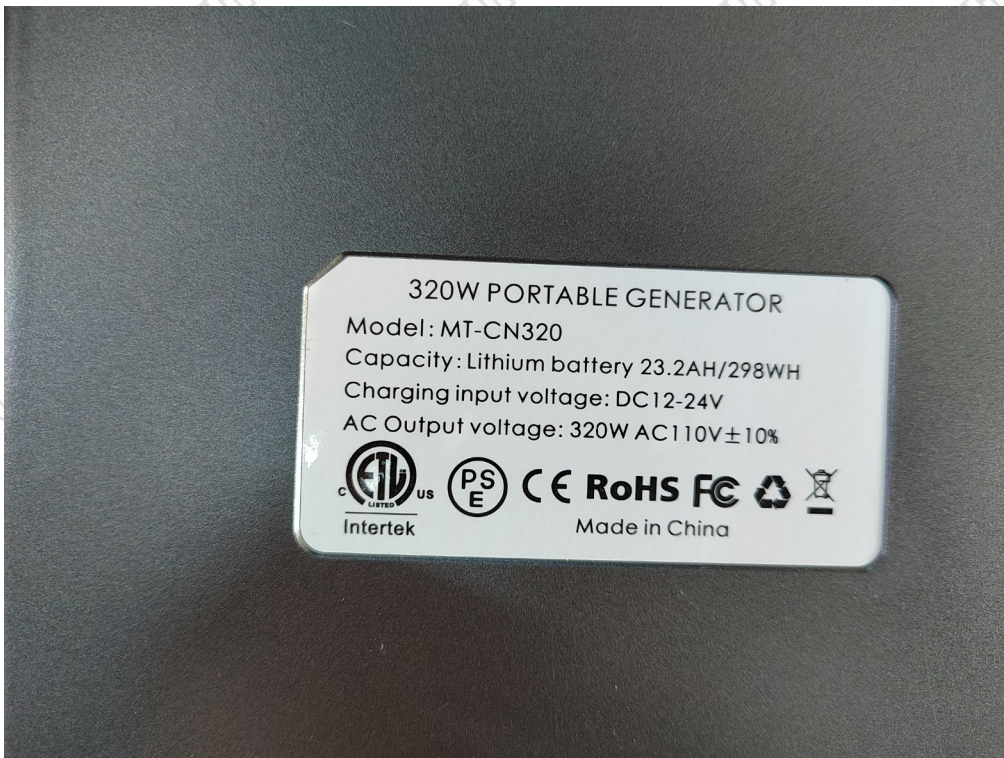
Figure 4 Battery label (标签)