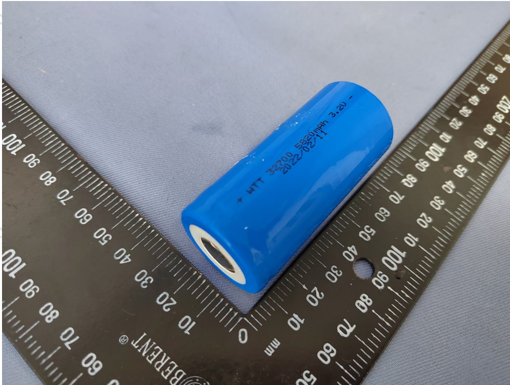
Figure 3 Overall view of cell (电芯图)