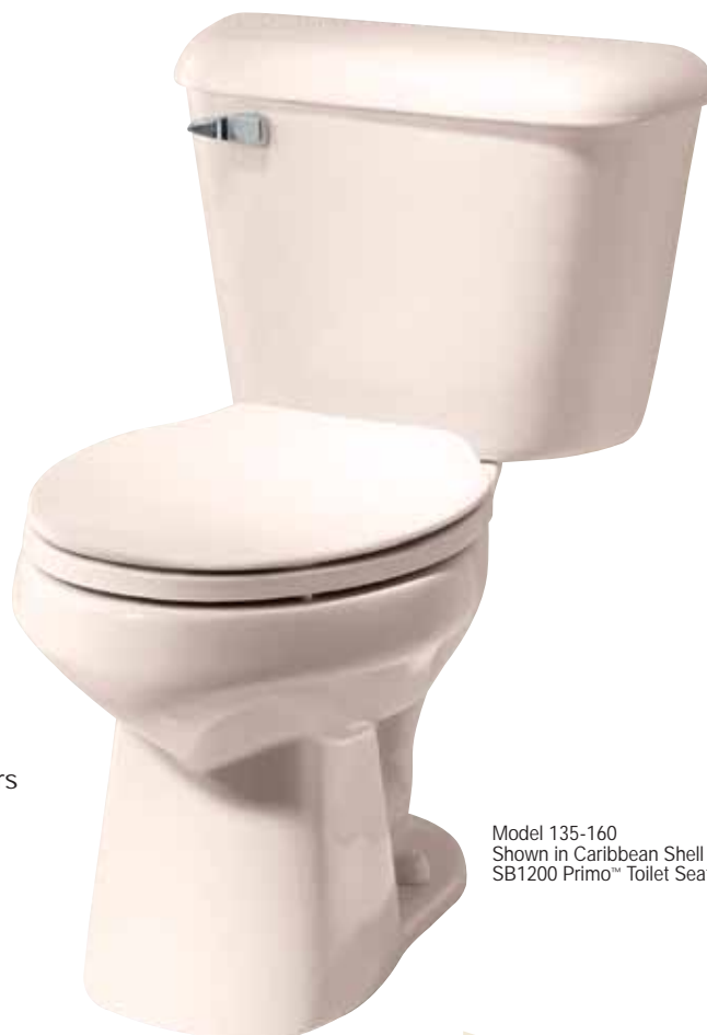
Model 135-160 Shown in Caribbean Shell with SB1200 Primo™ Toilet Seat