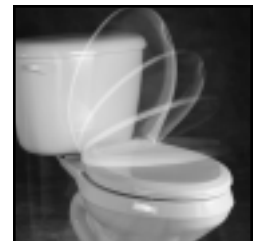
SILENT WHISPER•CLOSE™ FEATURE