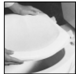
EASY•CLEAN & CHANGE™ FEATURE