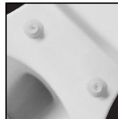
EASY REMOVAL OF TOILET SEAT FOR THOROUGH CLEANING