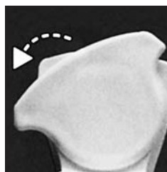
TWIST HINGE TO UNLOCK