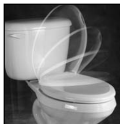
SILENT EASY•CLOSE™ FEATURE